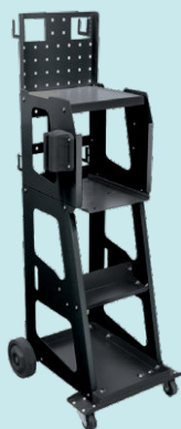
Spot 1000 trolley ref. 053540