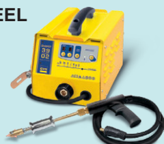
EASYLINER 39.02 - ref. 053618