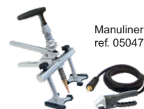
Manuliner ref. 050471