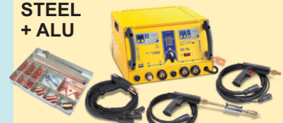
SPEEDLINER Combi 230 E PRO - ref. 036062