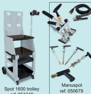
Spot 1600 trolley ref. 051348