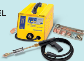
SPEEDLINER 39.02 - ref. 035010 SPEEDLINER 39.04 - ref. 035027