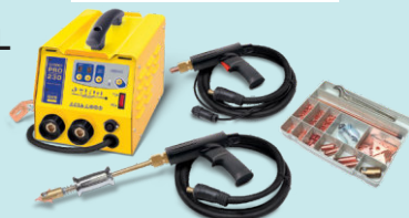
SPEEDLINER PRO 230 - ref. 036017 SPEEDLINER PRO 400 - ref. 036024