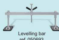
Levelling bar ref. 050693