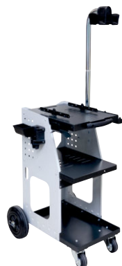
ref. 051331 + 052284 UNIVERSAL 800 + Over hanging arm