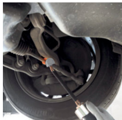
Releasing of steering linkage