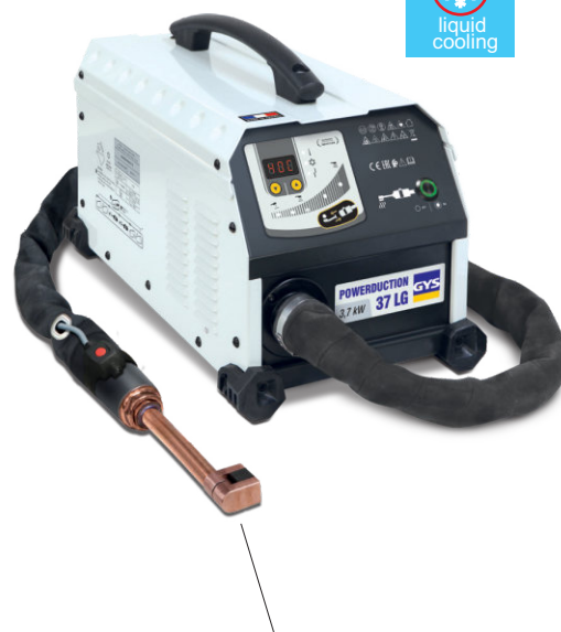
Supplied with a complete inductor 90°