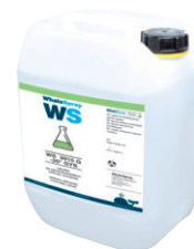
ref. 062511 Welding coolant - 5 l