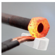
Releasing of rusted bolts